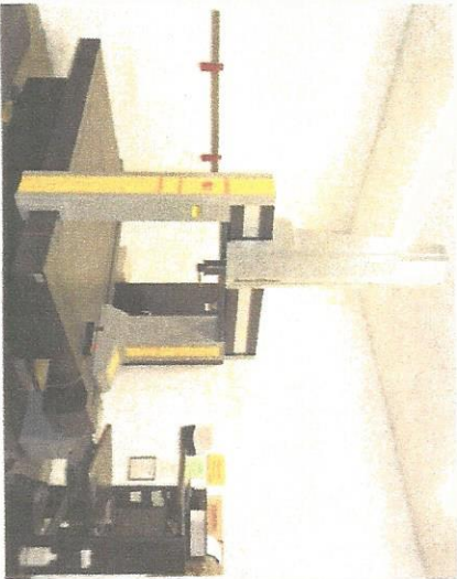
Brown and Sharp 12-20-10